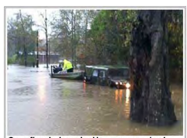
On a flooded road a Humvee acquired from DLA's Law Enforcement Support Office launches a boat in Livingston Parish, La. The parish had acquired six Humvees just two weeks before the flood hit; during the flood 137 people were rescued using the vehicles.

"The program is awesome," said the director . "You just don't know how many lives you have saved."