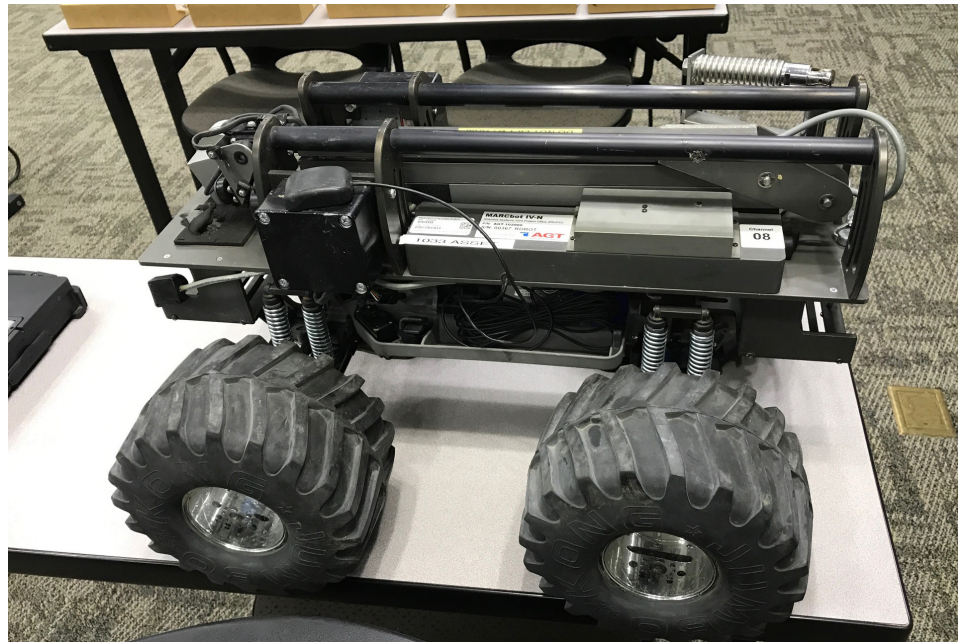
Explosive ordnance disposal robot acquired through the 1033 LESO Program.

Due to the nature of the equipment, the programs do receive citizen, media, and legislative scrutiny. We have an important, ongoing opportunity to engage Coloradans by providing the accountability and transparency that they require in order to make