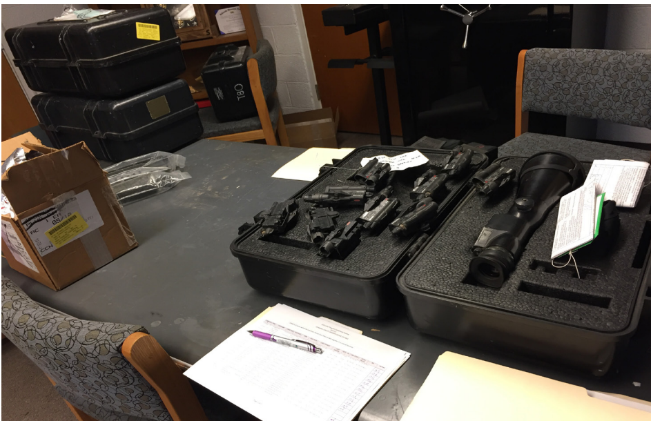
Sights ready for inspection during a Program Compliance Review.

A list of agencies that participated in a PCR during 2017 can be found on page 10 of this report, along with a map of locations visited.