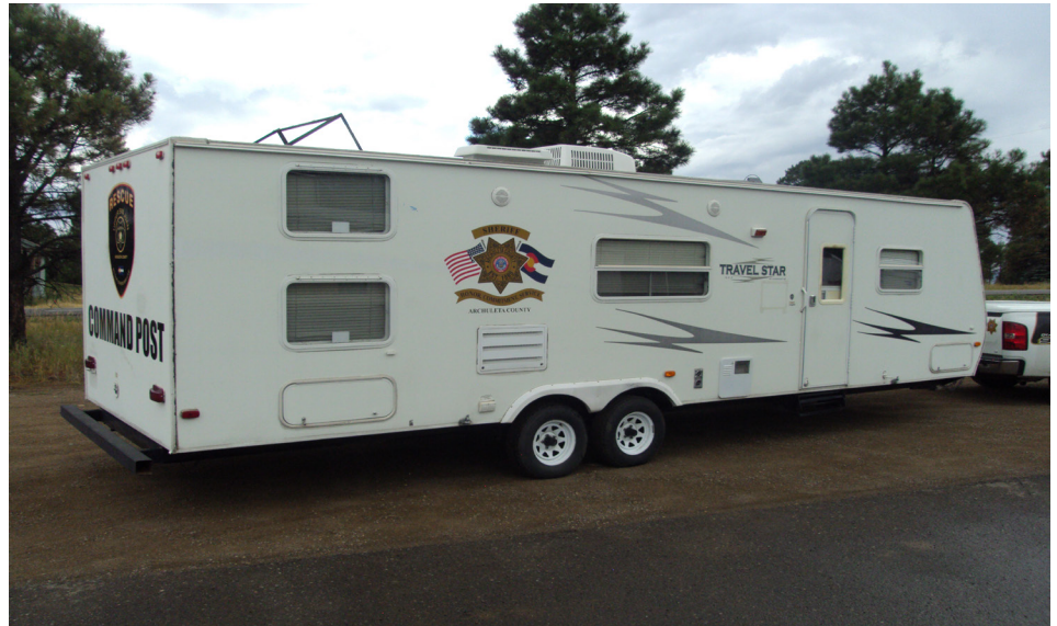
Archuleta County Sheriff's Office mobile command post.

the 1033 LESO and 1122 programs, we identified an opportunity to enhance services to customers of the programs. Colorado agencies that acquire specialized vehicles from the military through the 1033 LESO Program often struggle to obtain replacement parts. Utilizing the Department of the Army and the Department of Defense through