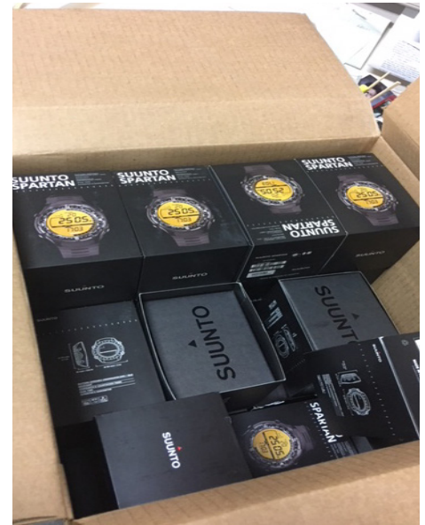
Multiple agencies acquired brand new watches through the 1033 LESO Program.

acquisition value ranging from $412,000 to $733,000, these vehicles accounted for more than $6.1 million of the $10.8 million in equipment acquired in 2014.