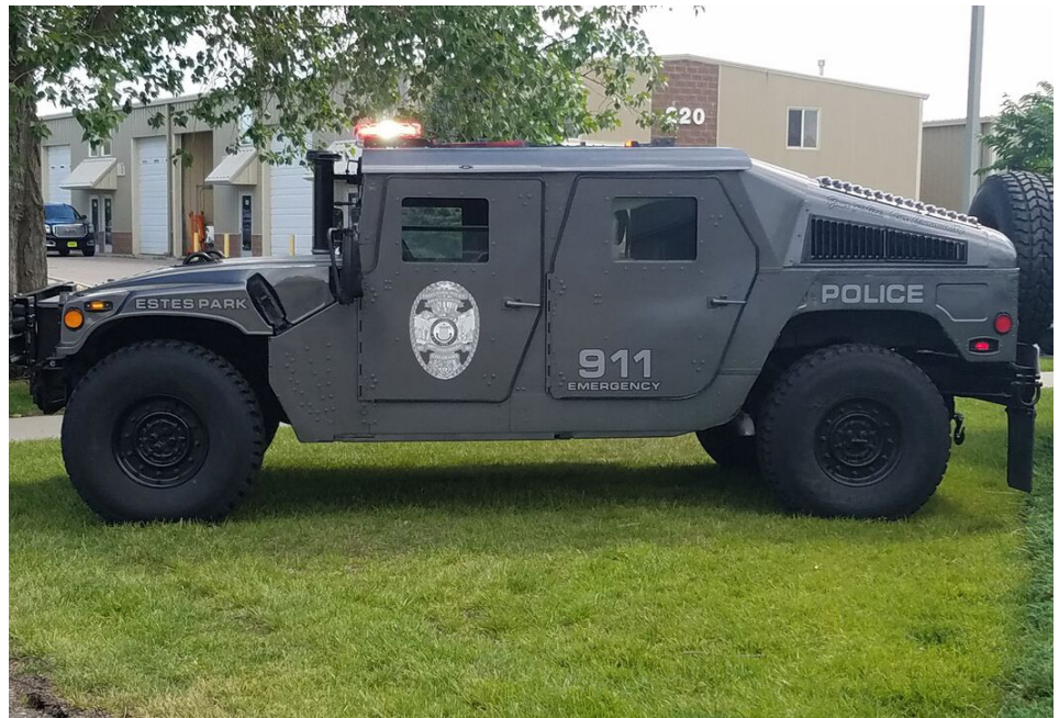
Estes Park Police Department Armored Humvee.

“ I wanted to share a success story using our MRAP last night on two barricaded subjects inside an apartment.