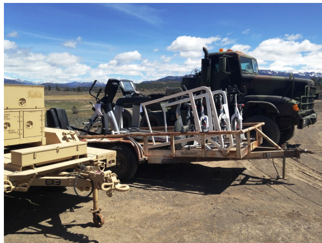
Truck, trailers, exercise equipment, and generator collected for the compliance review.

A big component of every compliance review is checking the equipment.