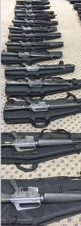
Rifles laid out in serial number order for inspection.