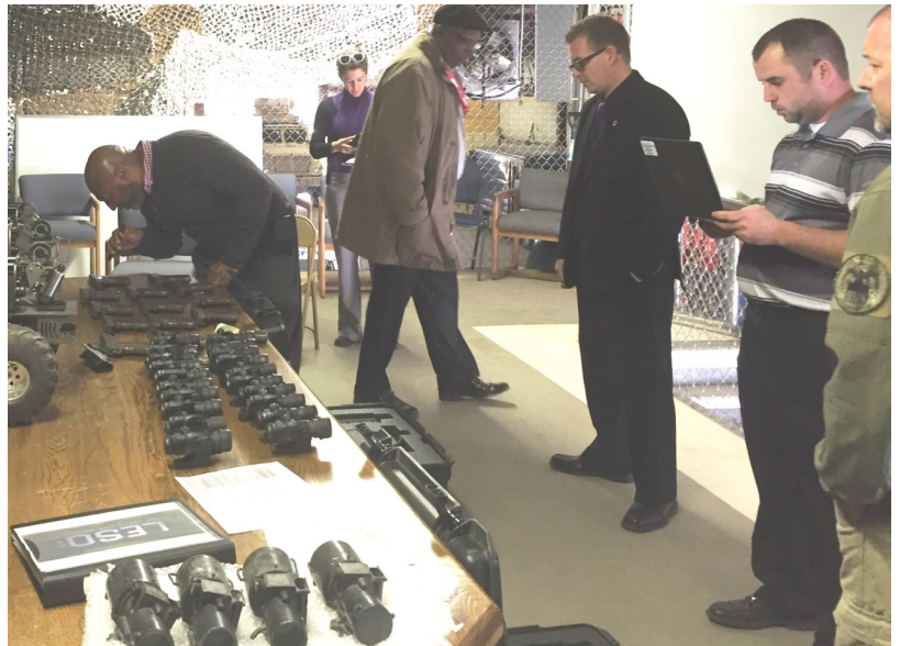
LESO members inspect equipment that was organized in preparation for the compliance review.

Here are some tips to help your agency prepare for a compliance review.